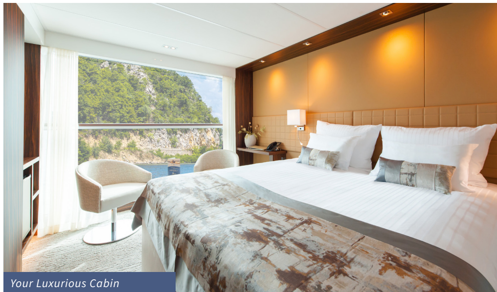
Your Luxurious Cabin

Today you will enjoy a tour of the city of Munich. Admire architectural wonders like the Old Town Hall, St Peter's Church and the Munich Residenz; stroll through the lively Viktualienmarkt; and see the world-famous Hofbräuhaus beer hall. Accompanied by an expert guide, you'll have ample opportunities to learn more about Munich's history, cultural heritage and beer-brewing legacy, while walking between the central squares of Marienplatz and Odeonsplatz. Continuing on you will enjoy a scenic drive to Passau, a fairy-tale city founded more than 2,000 years ago,